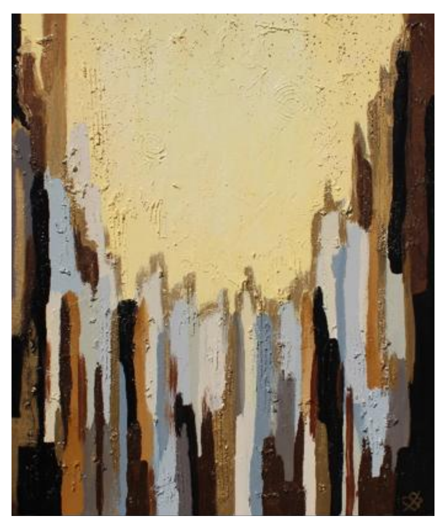
City that Never Sleeps, 48" x 60"