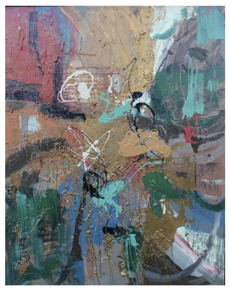
Exploration 3, 48" x 60"