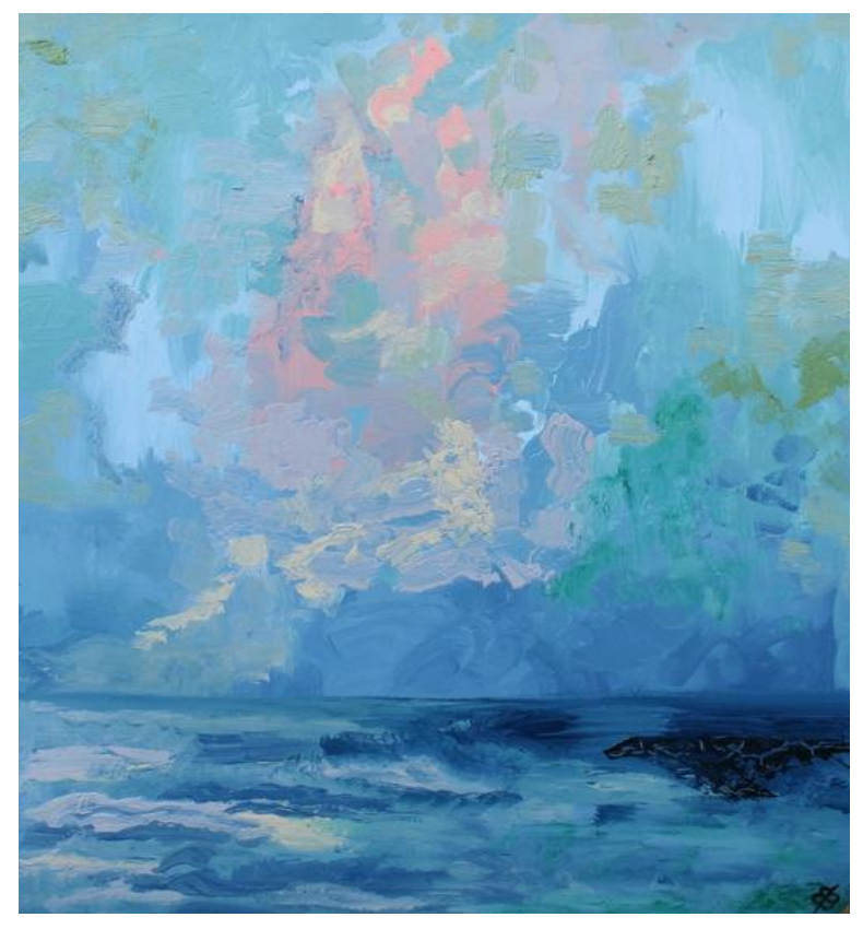
Solitude, 48" x 60"

Interview with Elena Bulatova Russian-born Palm Springs-based Elena Bulatova at Red Dot Art Fair and Verge Art Fair