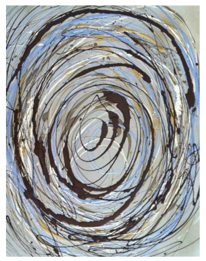
Frappucino 48" x 36"